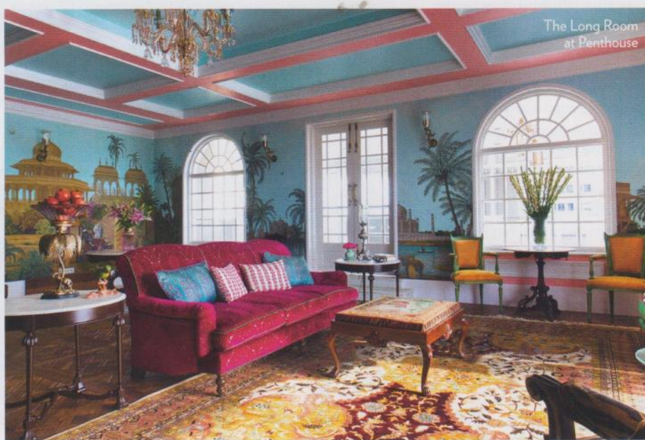
The Long Room at Penthouse