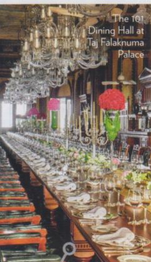
The 101 Dining Hall at Taj Falaknuma Palace

Unwind at a boho island retreat in ANDAMANS