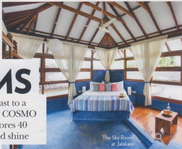
The Sky Room at Jalakara