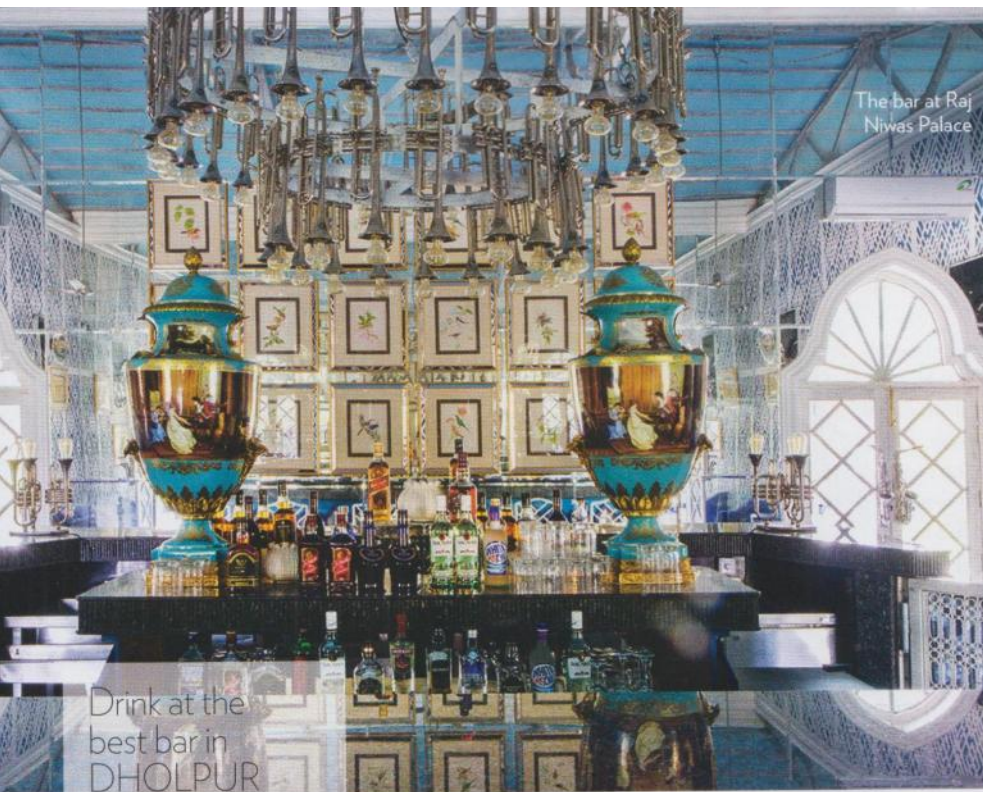
The bar at Raj Niwas Palace