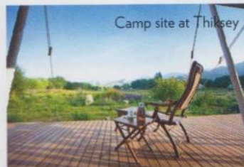
Camp site at Thiksey

The word 'Sukh' that translates to happiness is easy to find at Oberoi's verdant Sukhvilas near Chandigarh. Spend time forest-or moon-bathing or sign up for their hammam treatments. Stargazing and superb advice from the resident Ayurvedic doctor are other rewards you will receive with a stay here. Oberoihotels.com