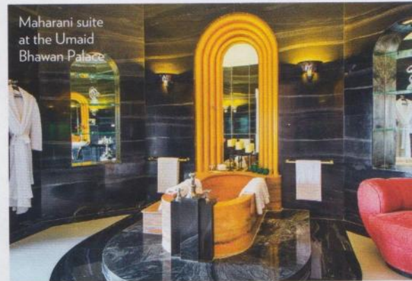
Maharani suite at the Umaid Bhawan Palace