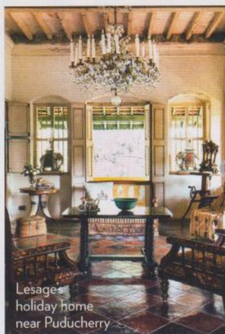
Lesage holiday home near Puducherry