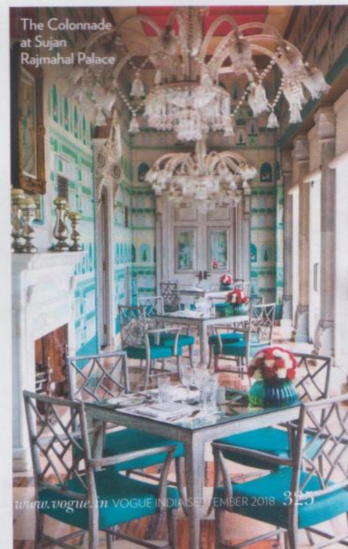
The Colonnade at Sujan Rajmahal Palace